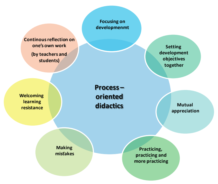
Figure 3. Elements of process-oriented didactics.

learning guides and therefore try to develop their own concept of teaching and learning continuously, cooperatively, and reflectively. Focusing on the learning process involves constantly questioning teachers' and learners' progress and recognising new development objectives. Process-oriented didactics provide plenty of space for both teachers and pupils to practice, in order to attain individual learning objectives.